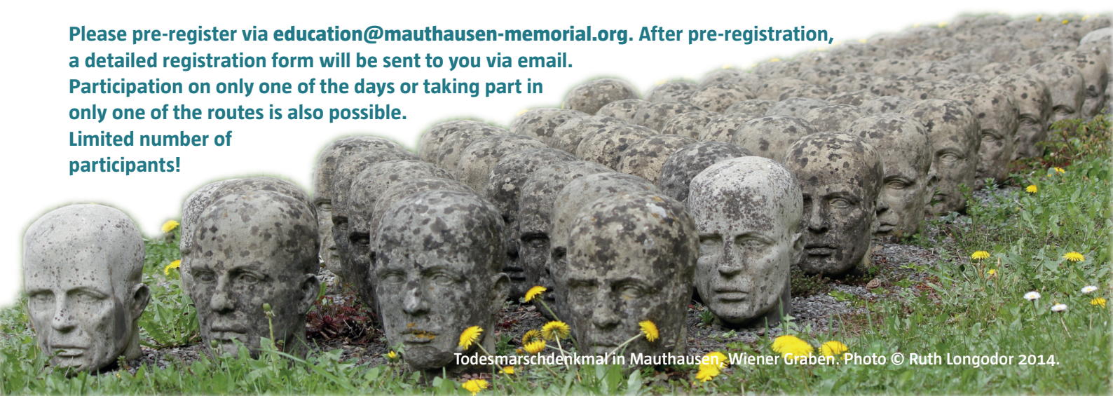
Todesmarschdenkmal in Mauthausen, Wiener Graben.